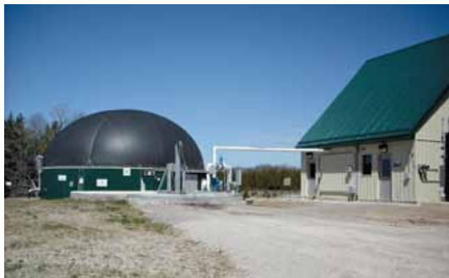
The Georgian Bluffs/Chatsworth biogas facility showing digester.

It was natural that any solution started at the sewage lagoon facility. An anaerobic digester built there would generate biogas, and so could solve the land application problem while generating green energy and revenue.