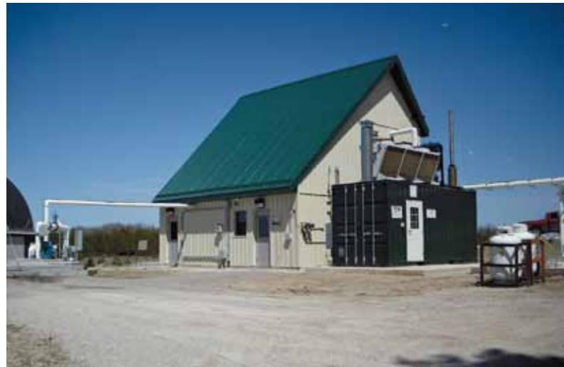
The facility was constructed in 2010 by Maple Reinders Constructors Ltd.

In the next few years the performance of this plant will help de-